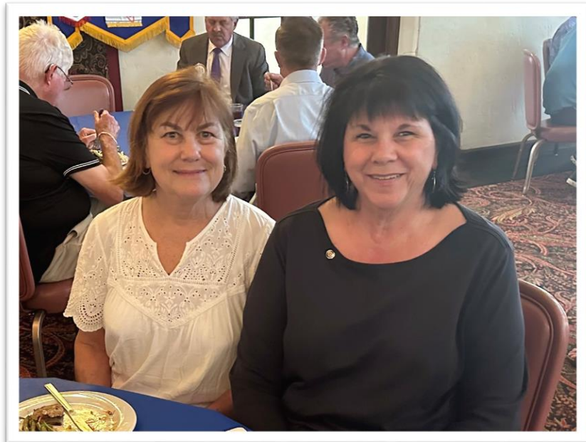
Guests of Rotarians: