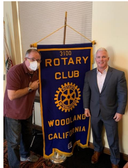
Prop 47 - The Safe Neighborhoods and Schools Act November 2014